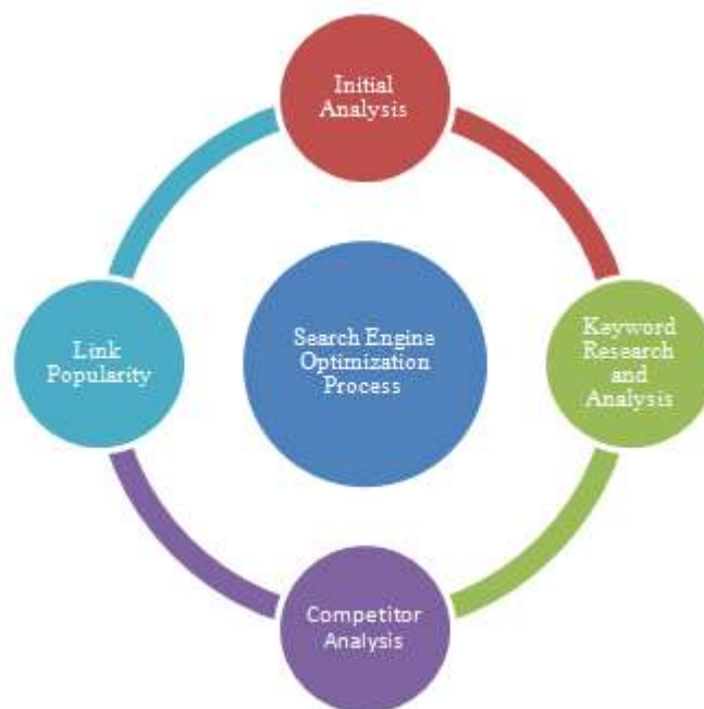
Figure 1: Search Engine Optimization Process

of the same techniques as a part of that. The main difference between the two terms is that SEM also includes paid online advertising models, such as pay-per-click (PPC). PPC advertising models are those such as Google Adwords and Bing, which only require payment when the ad is clicked through to the target website. SEM also requires keyword analysis as the words and phrases used in the ad and site and these need to be monitored carefully to reflect the market and current search engine rules. Whilst it can be said that SEM encompasses all kinds of digital marketing, it's more commonly thought of in a narrower niche, to describe paid models. Figure 1 represented into process types of Search Engine Optimization.