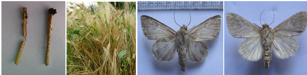
Damaged barley stem.