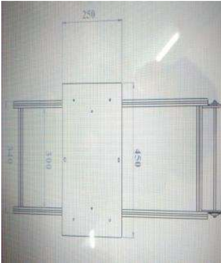
Figure 1 DESIGN OF FRAME

frame decided the motion of the welding machine. The frame is portable because this type of spot welding are domestic purpose.