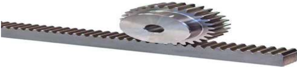
Fig -1 Rack and pinion

A rack and pinion is a type of linear actuator which contains a pair of gears of which one is vertical and other is circular both combine converts rotating motion into linear motion. The circular pinion engages teeth on the "gear" bar – the rack. When the load is applied the rack moves downwards and creates motion in the the circular pinion.. Rack and pinion mechanism converts the pressure applied by vehicle into rotary motion.