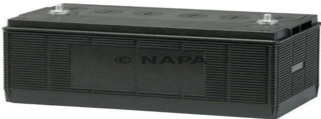
Fig – 4 BATTERY

Battery is used to store energy produced by the DC generator. A battery is composed of one or more electrochemical cells. The term "accumulator" is also termed for battery as it accumulates and stores energy through a reversible electrochemical reaction. Batteries are produced in many different shapes and sizes, and ranging from different capacity.