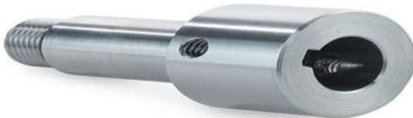
Fig – 2 shaft

A shaft is a rotating motor element, usually circular in cross section, which is used to carry power from one part to another, or from a motor which produces power to a motor which absorbs power. Shafts are commonly made of mild steel. When more high strength is required, alloy steel such as nickel, nickel-chromium or chromium-vanadium steel is used. The rotation of shaft due to rack and pinion mechanism act as a input to dc generator which produces the desired electrical output.