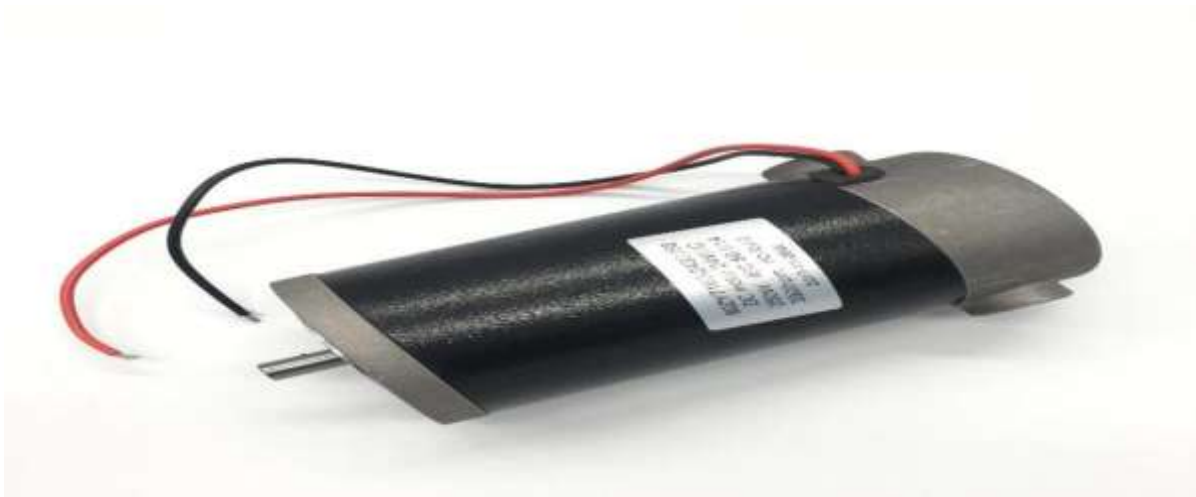
Fig – 3 PMDC motor (as a generator)

by mechanical arrangements into electrical output. The input to dc generator is fed by the rotation of shaft obtained from rack and pinion system.