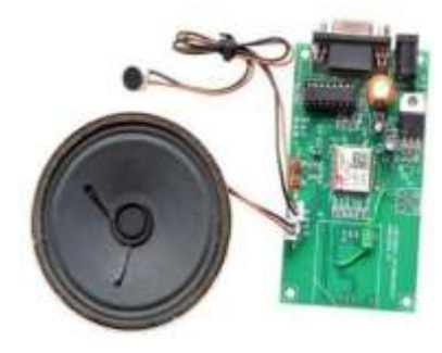
Fig.5.GSM Voice Modem

This GSM Modem can accept any GSM network act as SIM card and just like a mobile phone with its own unique phone number. Advantage of using this modem will be that you can use its RS232 port to communicate and develop embedded applications. The SIM800C is a complete Dual-band GSM/GPRS solution in a SMT module featuring an industry-standard interface, the SIM800CS is a quad-band GSM/GPRS module that works on frequencies GSM850MHz, delivers performance for voice, SMS, Data, and Fax in a small form factor and with low power consumption.