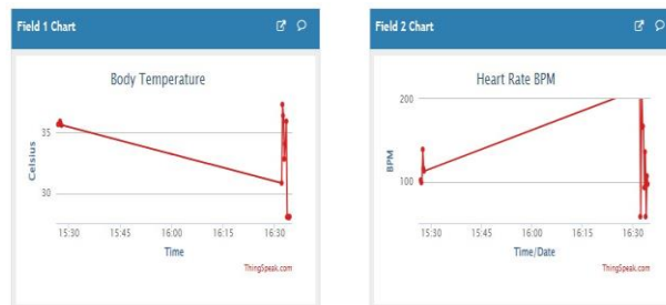
Figure 3 Heart rate monitoring range