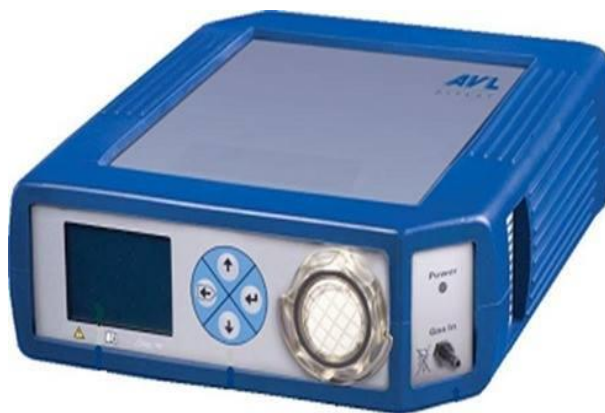
Figure 2. Gas Analyzer