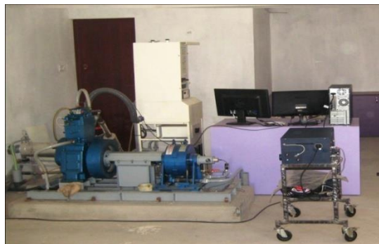
Figure 1. Experimental Setup

The experimental setup consists of a KirloskarTAF and also consists of alternator. The load is controlled by load cell. Air is flows through an airflow sensor which measures the amount of air taken. Fuel consumption readings were measured with help of a fuel sensor. AVL 444 gas analyzer can be used to measure the emissions of hydrocarbon, carbon monoxide, carbon dioxide and oxides of nitrogen from the exhaust pipe.