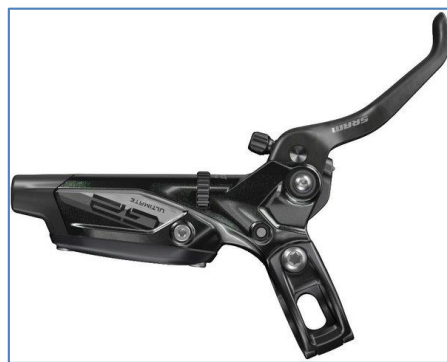
Fig. 2 wheeler hand brake

The fundamental capacity of brake levers is to actuate the brake system, which permits individuals to back off or stop while they are riding a bicycle. There are two sorts of component: repairman brakes or water powered, and both working and viability are extremely extraordinary. Likewise, there are contrasts between all sort of modalities there are in the realm of biking, without considering in the event that they are pressure driven or repairman and distinctive sort of materials, contingent upon the nature of them. The working of brake levers is basic. On the off chance that we talk about a technician brake switch, above all else we have to push it. This activity extends a metallic rational that allows the two brake cushions put focus on one of the two-wheel edges. The working of water driven brakes is somewhat extraordinary. Here so as to stop the bicycle, the brake switch pushes exceptional oil making weight and making the bicycle delayed down or stop. The undertaking that brake levers need to do makes them to arrive at some fundamental properties. So they have hardness and solidness as well as gentility and obstruction. What's more, this has a straightforward clarification; these levers must have the option to help an amazingly hand-push without breaking or twisting, so they make feasible for individuals to hinder the bicycle with no risk